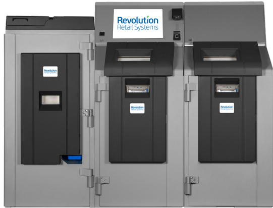
Paragon 3SE/4SE Dual