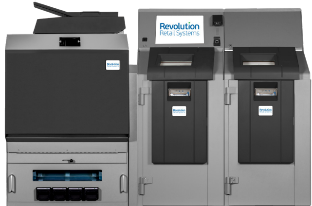
Paragon 3LW/4LW Dual