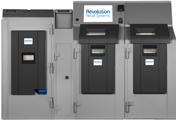
Paragon 3SE/4SE Dual with Drop Vault