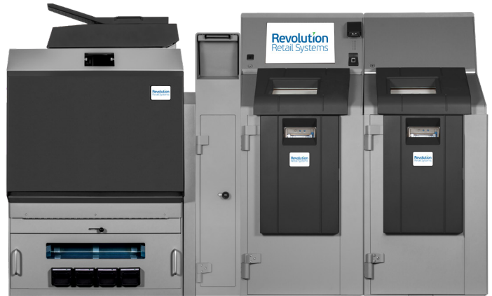
Paragon 3LW/4LW Dual with Drop Vault