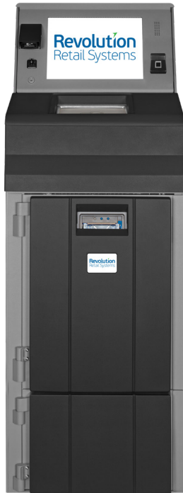
Fortis 4/5 Notes