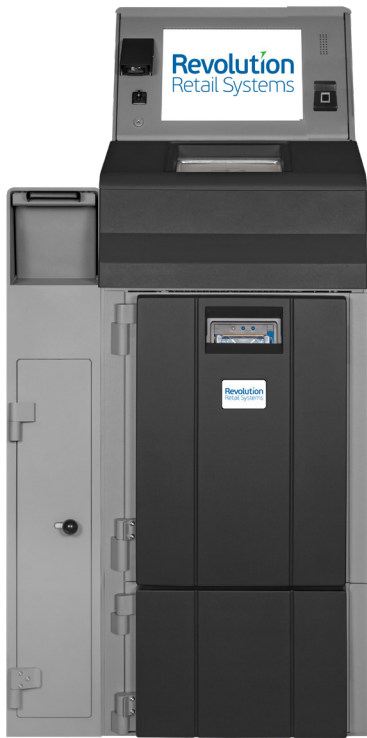
Fortis 4/5 Notes with Drop Vault