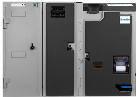
Quantum 4S/6S AV