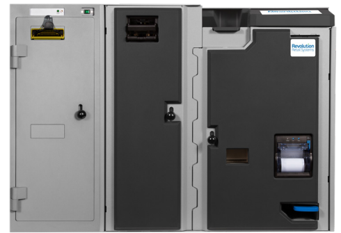
Quantum 4S/6S MV