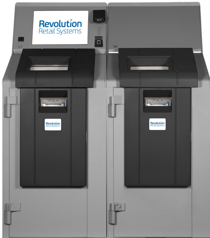
Paragon 4 Notes Dual