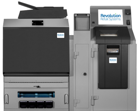
Paragon 3LW/4LW with Drop Vault