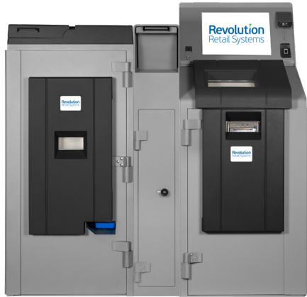
Paragon 3SE/4SE with Drop Vault