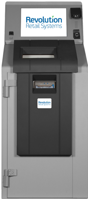
Paragon 3/4 Notes