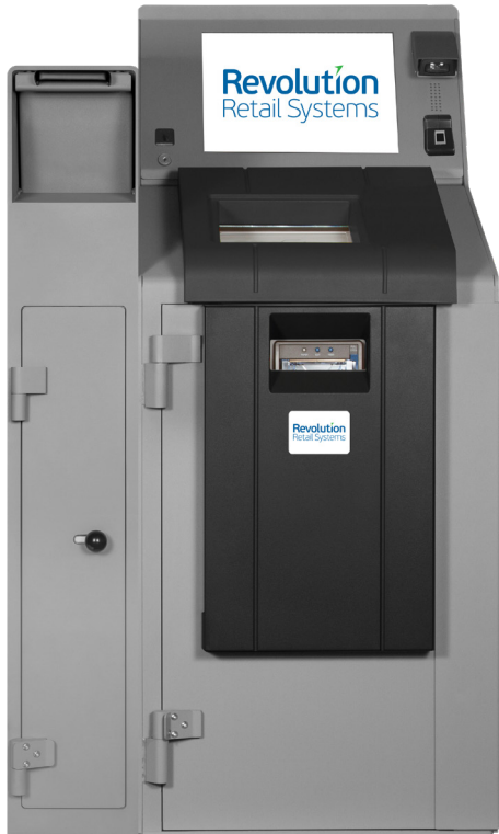
Paragon 3/4 Notes with Drop Vault