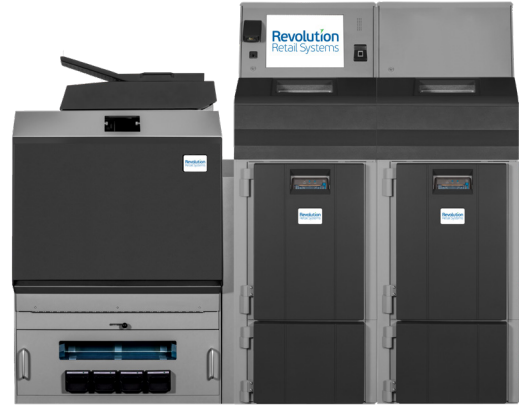
Fortis 4LW/5LW Dual