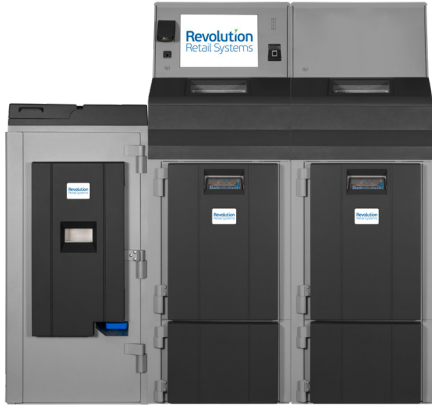
Fortis 4SE/5SE Dual