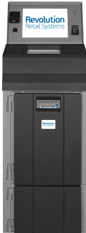
Fortis 4/5 Notes