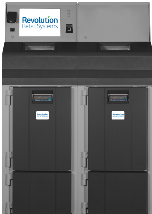
Fortis 4/5 Notes Dual