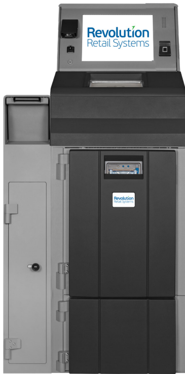
Fortis 4/5 Notes with Drop Vault